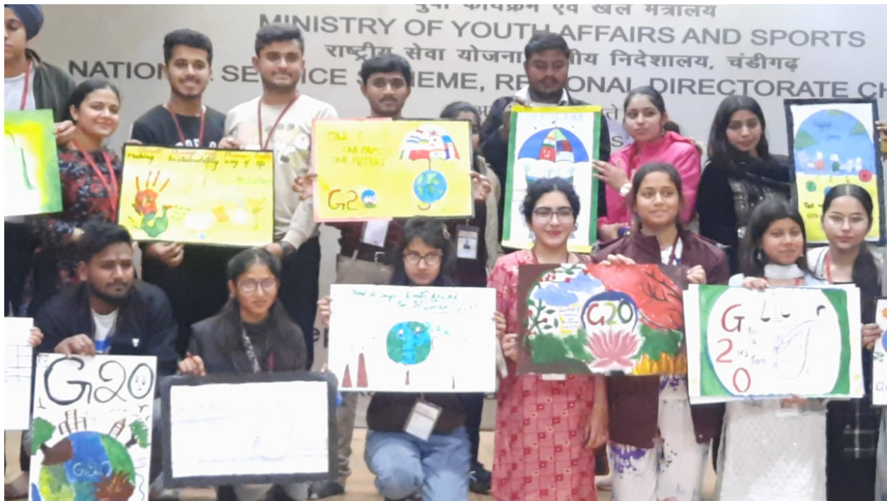
Painting /Poster activity and Group discussion activity at NIC PUP