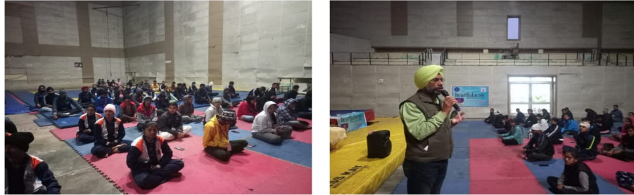
Prabhat Pheri by all the Contingents