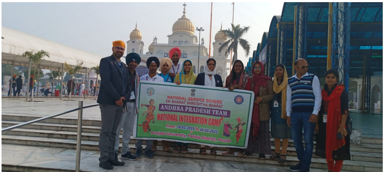
Heritage visit to Fatehpur sahib and Anandpur Sahib date: 19/02/2023

Day 4 the NIC team taken all the volunteers and Pos to Heritage visit and showed very important places of Punjab Fatehgarh Sahib and Anandpur sahib sacrifices. How the religion is developed and Sikhs culture occupation and bravery were well explained to all by the organizers. An amazing museum KHALSA was showed to all the volunteers . khalsa museum shows the sikh religion culture and heritage. We all had breakfast and lunch at gurudwara ( langar free meal Prasad of sikh gurudwaras). The whole day was spent visiting those places and we all reached our hostels by 9.30pm.