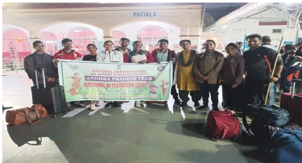
Reached Patiala station by 6.45pm on 15 th Feb 2023