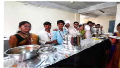
AP CONTINGENT AND KERALA CONTINGENT ACTIVE PARTICIPATION IN MESS ACTIVITY: Serving the dignitaries with AP and kerala Traditional wear.