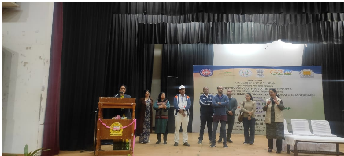
AP contingent introducing NSS volunteers to NIC team in Kalabhavan, Punjabi University, Patiala