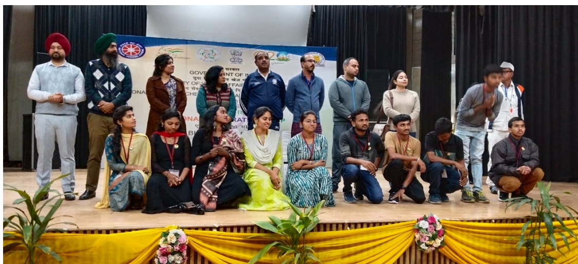
NSS volunteers of AP team withat NIC programme officers