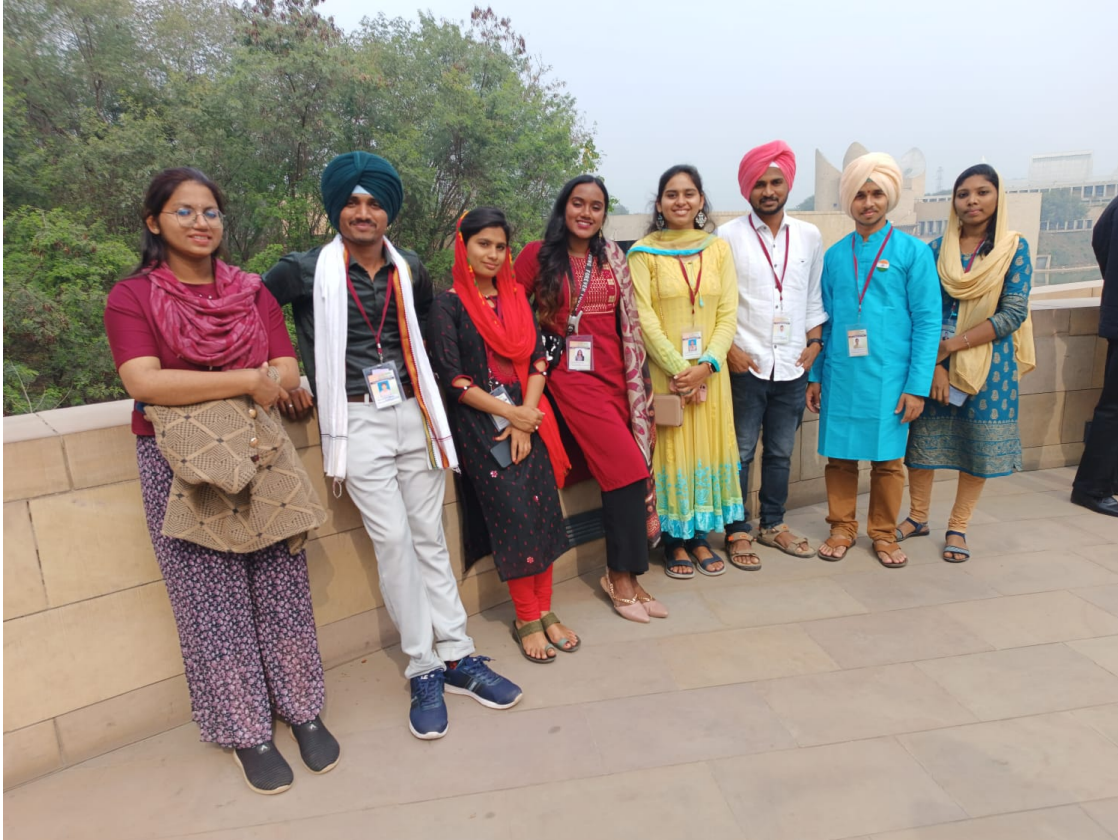
Heritage visit to Anandpur sahib Gurudwara & Khalsa museum on Sikhism