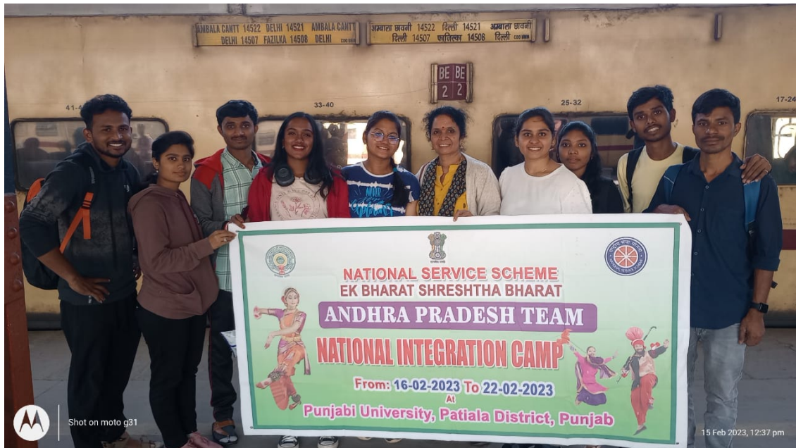
Train journey to Patiala from New delhi on 15 th February 2023