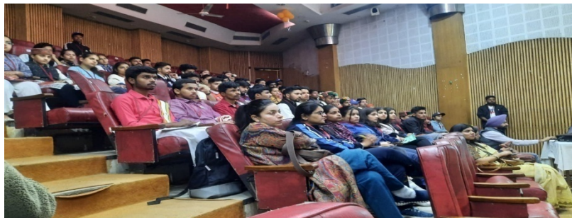
Volunteers from Different states at auditorium