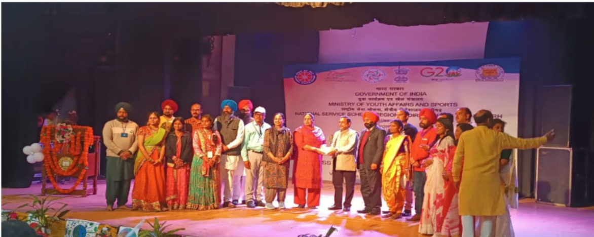
Cultural Rally in PUP Campus & Ek Bharath Shreshtatha Bharath theme