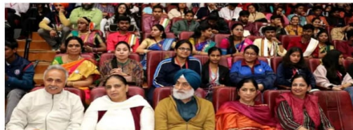
Day 2 -17/02/2023